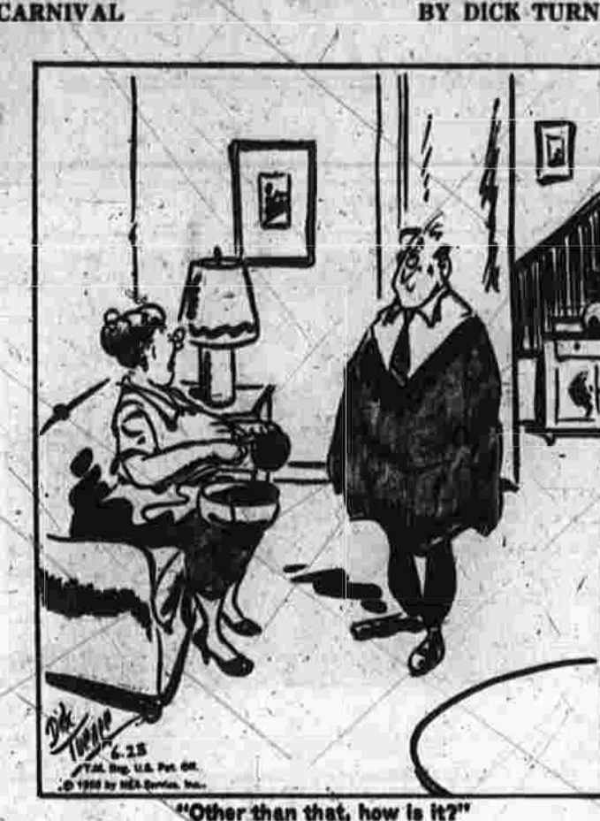
"Other than that, how is it?"