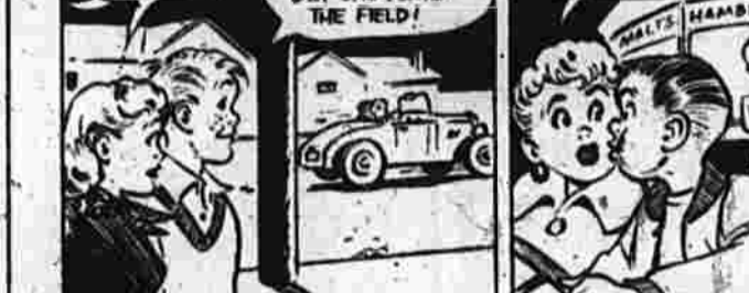
"VEAH, HE'S BEEN BREAKING HIS HEAD ON THE FIELD!"