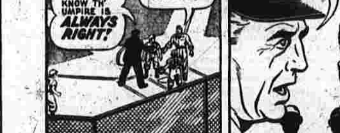
"COTTON WOODS, ALWAYS RIGHT!"