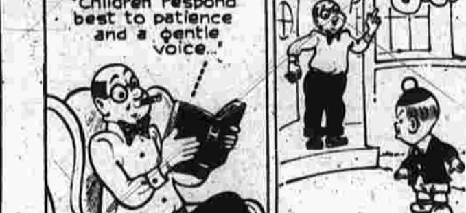
Children respond best to response and a voice.