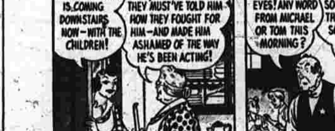
"MRS. FINN—PINK WELLS, THANK GODNESS! YOU MUST TALK TO THE CHILDREN!"