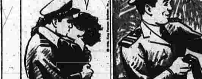
"DARLING! HOW BURNING, THINKING EYES..."