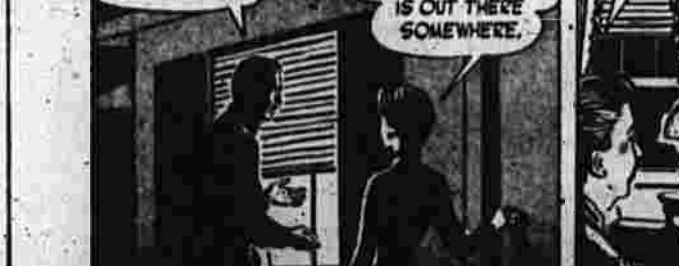
"I'M TALKING TO THE NEXT NEIGHBOR TO SEE ABOUT HIS DOGS..."